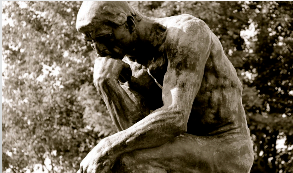
Statue : The Thinker Artist : Auguste Rodin Date : 1902